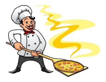
the Alfredo's Pizza